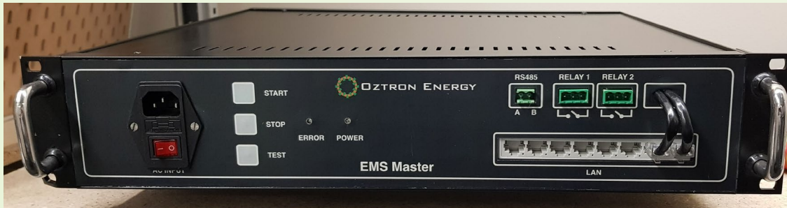
Rack-mounted EMS for Generation Management